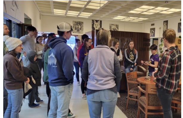
A show and touch discussion about the herpetology collection in the CNR.