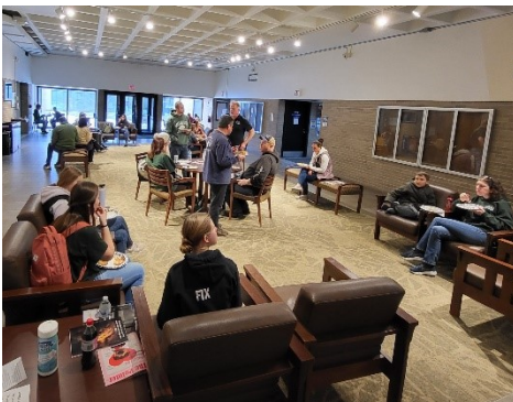
Committee members, YCC delegates and UWSP staff enjoyed a pot luck lunch.