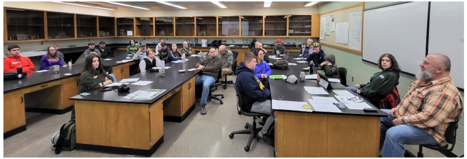
The YCC Oversight Committee met at UW-Stevens Point on March 4th. The committee discussed upcoming YCC activities and welcomed input and planning ideas from YCC delegates.

This was an incredible educational and networking opportunity. The YCC is fortunate to have great partners and support at UWSP. Everyone enjoyed this experience and we have a several YCC delegates who are considering UW-Stevens Point as they plan for their future.