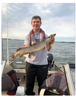
Fishing in Minnesota with family.

When you join the YCC as long as you have the drive to learn and participate in new activities you will no doubt have a good time. The YCC will allow you to experience and learn many new things that you had never been able to do. While COVID may have put a damper on activities I guarantee that there will be more offered when pandemic is finally done.