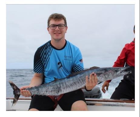
Wahoo caught in the Pacific Ocean off the coast of the Galapagos Islands.