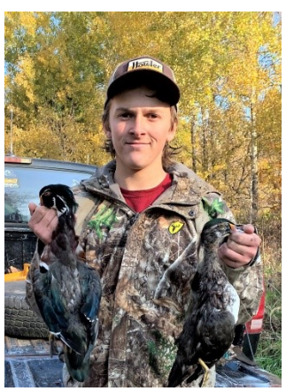
Fall duck hunting