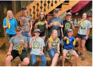
YCC delegates showing their newly designed lures and flies