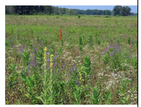
Karner survey area Showing abundance of nectar plants for adults