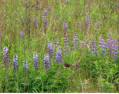
Wild Lupine Critical to survival of Karner caterpillars