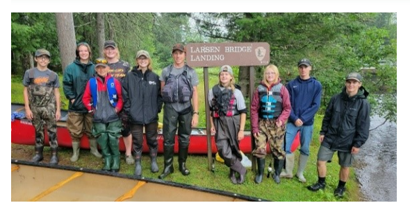
Ten YCC delegates participated in the 2021 YCC Summer Program in Hayward, on the Namekagon. Over the weekend, the group learned about trout ecology, river macroinvertebrates, fishing techniques, fly tying, local history of the area, and so much more!