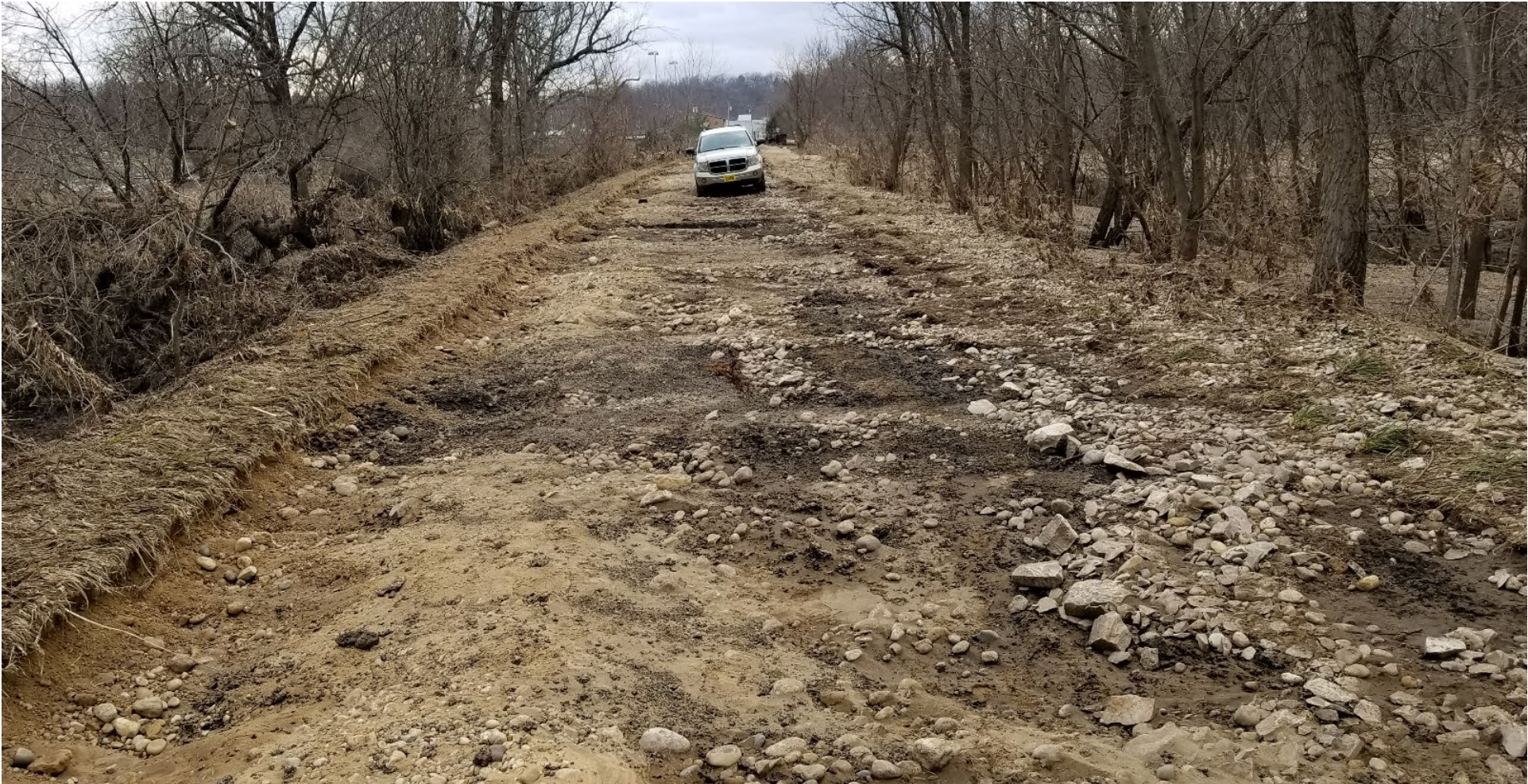
This is a picture showing the loss of base materials that we experience on a regular basis on the Cheese Country trail. We continue to grade, but we don't have any gravel left in spots to work with. This is Allen to Allum in Green County. Thanks Tom