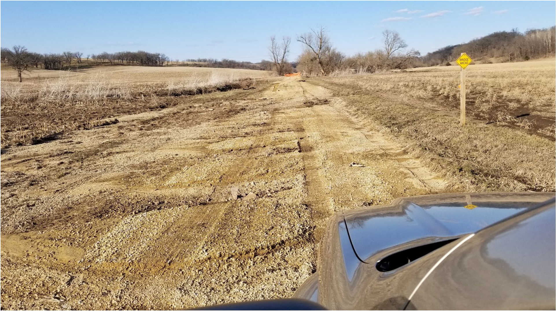
Trail condition after spring flooding. Just to the east of Browntown in Green Co