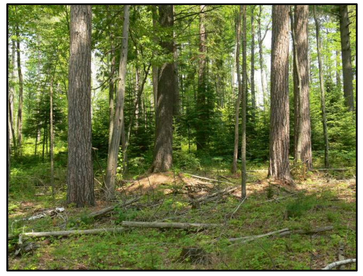
Figure 24.8. Reserve trees retained as a group.

Stand representation and spatial distribution patterns of reserve trees can be highly variable. The goal of heterogeneity of conditions indicates a wide array of retention strategies. Retention design, including amount to retain, species, and distribution, can enable the production of increased benefits and minimize potential costs. Criteria to consider when determining desired representation and distribution include landowner goals and stand management objectives, current and desired stand and community condition, characteristics of current and desired plant and animal species, potential damaging agents, site, and landscape characteristics. Detailed landscape analysis and planning that clearly addresses the sustainable allocation of resources, including the production of timber and the conservation of biodiversity, can improve upon stand-based management guidelines (such as those offered herein).