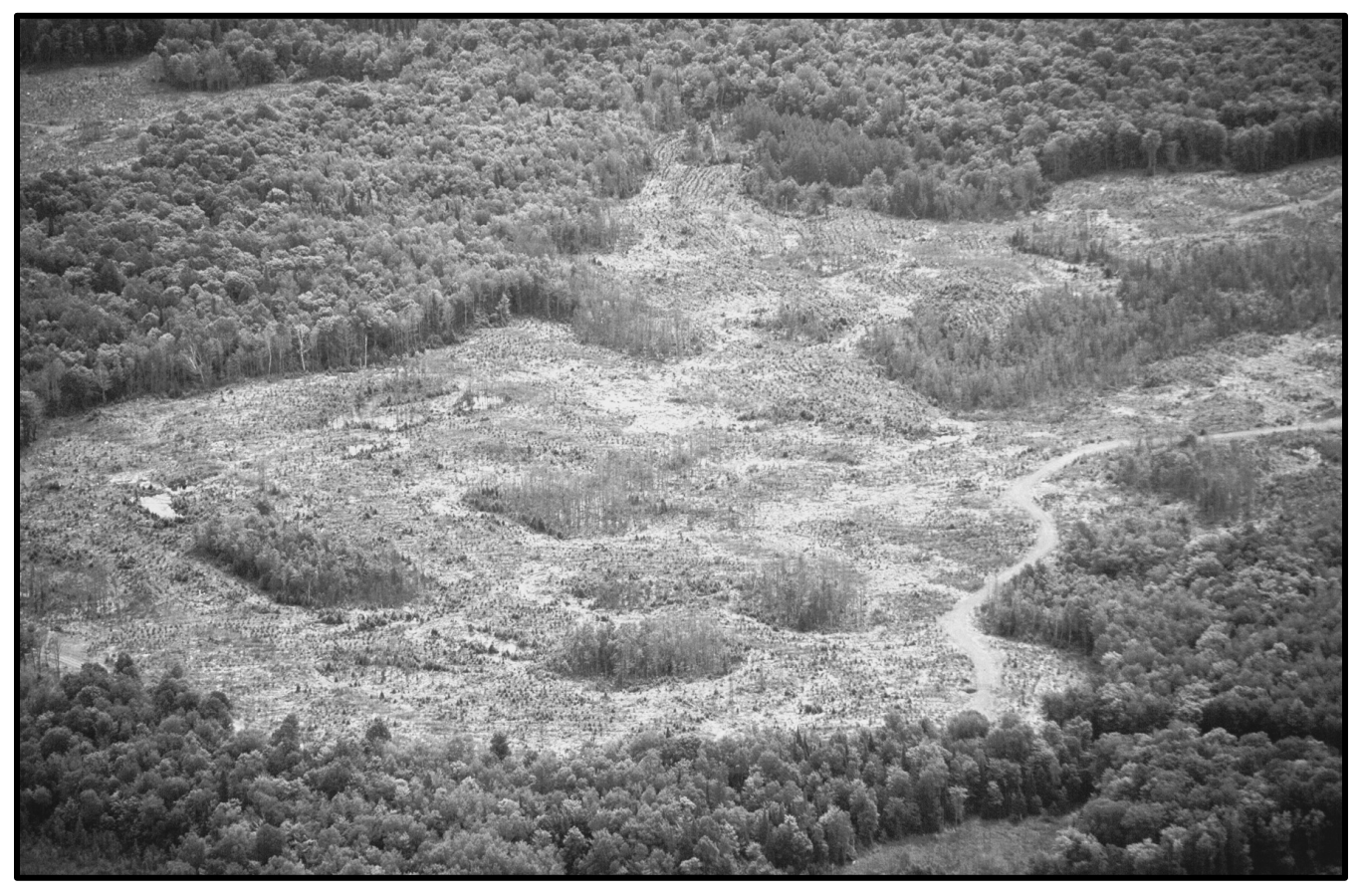
Figure 24.7. Reserve trees retained in patches.

Retention of evenly dispersed individual trees also provides unique benefits, including: