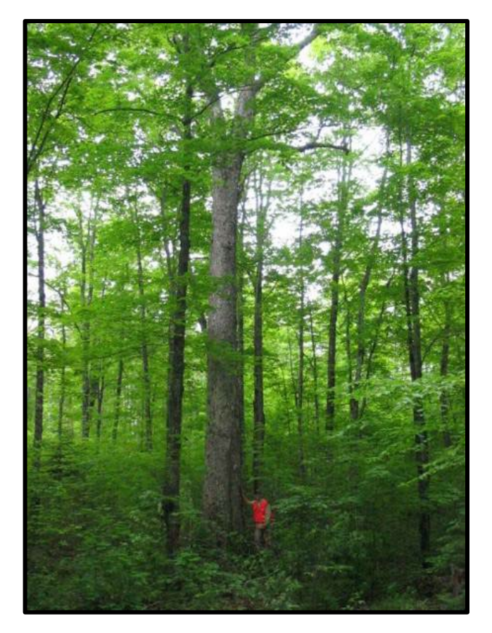
Figure 24.1. Large yellow birch tree.