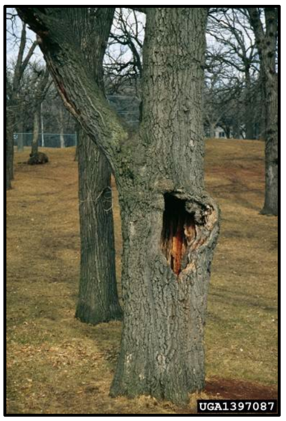
Figure 24.2. Cavity tree.