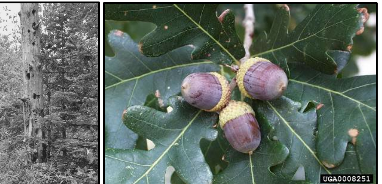
Figure 24.3. Snag.