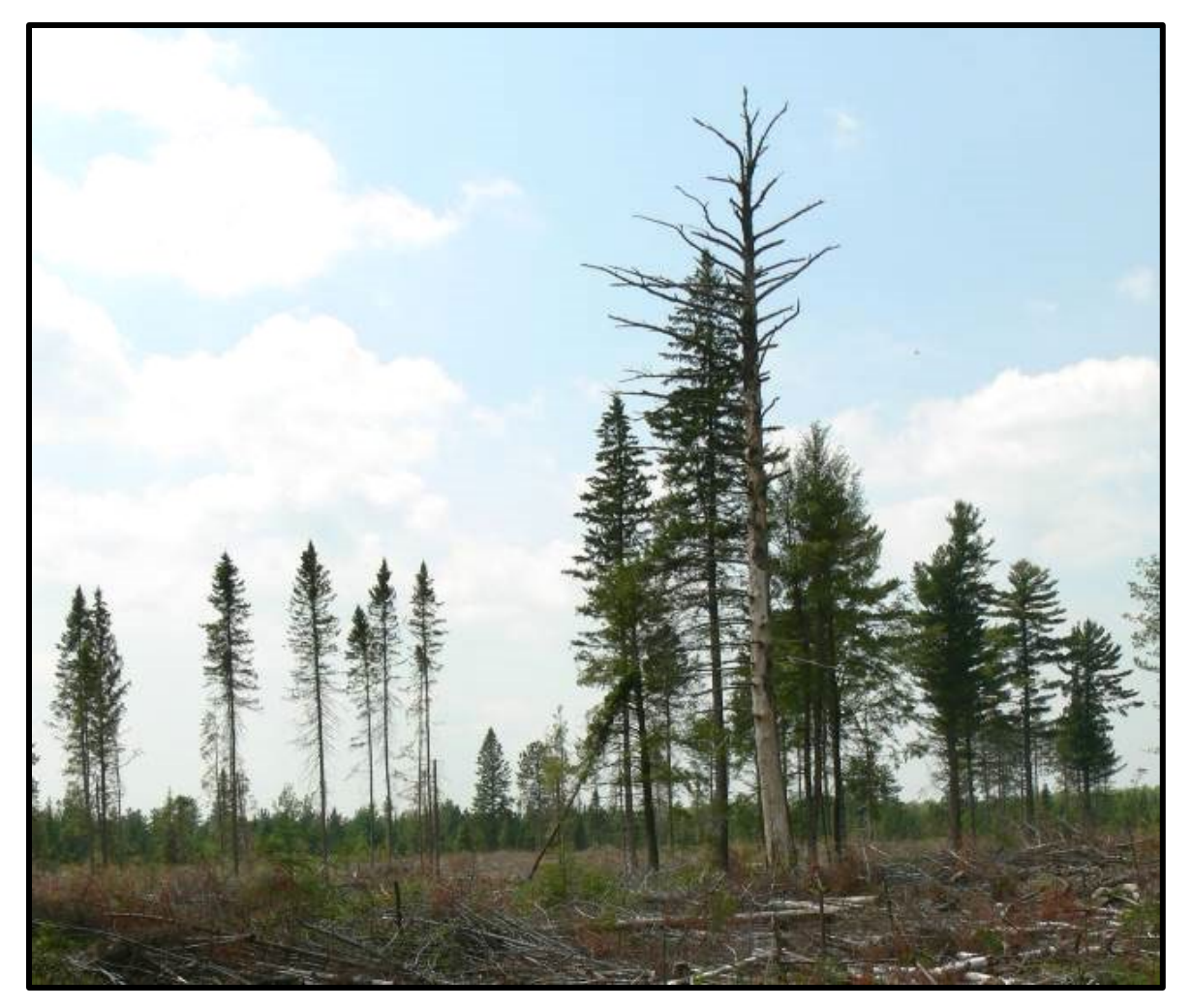
Figure 24.9. Reserve trees retained irregularly as individuals.

8.4 Recommendations for Retention in Managed Stands: Reserve Trees, Mast Trees, Cavity Trees, and Snags