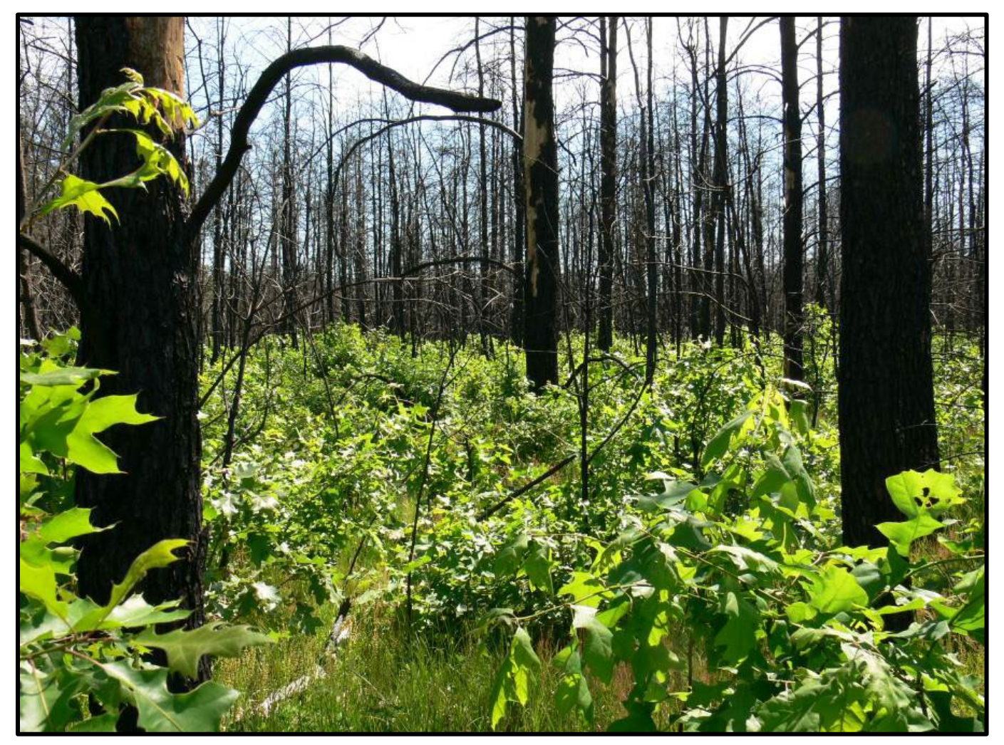
Figure 24.6. Biological legacies following fire (photo by Joe Kovach).

species, vernal pools, seeps, wet depressions, cliffs, rock outcrops, ravines, and caves. Some of the forest cover type chapters in this guide provide biodiversity management considerations, and specific species are sometimes addressed.