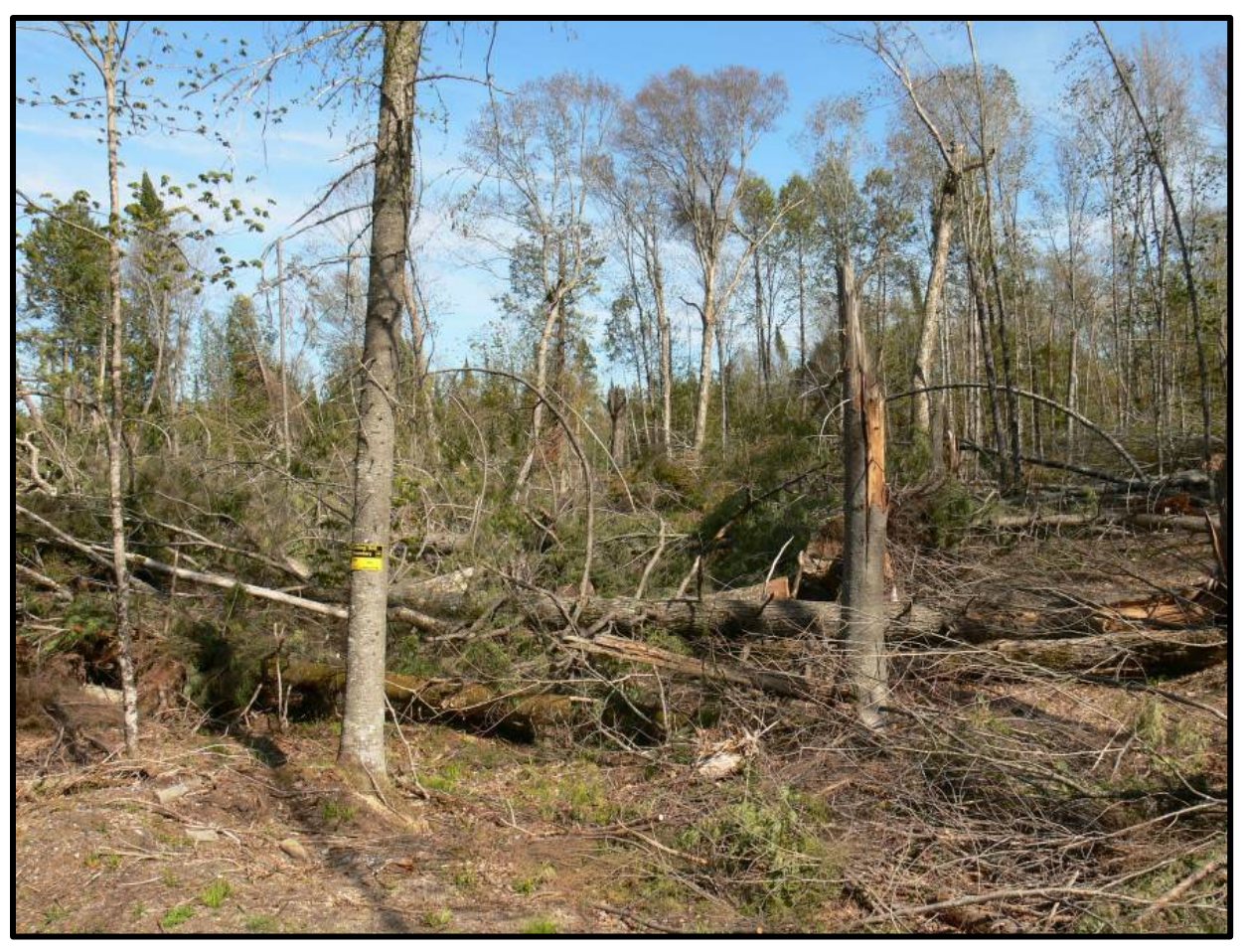
Figure 24.5. Biological legacies following windstorm.

Many biodiversity and endangered resources issues are addressed at the landscape level, and then through the protection of special habitats. Within managed stands, identify and protect element occurrences and special habitats. Follow general wildlife management guidelines; select and retain wildlife trees, including reserve trees as dispersed and aggregated individuals, groups, and patches. By integrating the identification of special habitats and microsites with the retention of reserve tree patches, multiple benefits can be achieved. Areas to consider when selecting patches for retention include groups of trees that are older or have high species diversity, sites where understory composition exhibits high diversity or uncommon