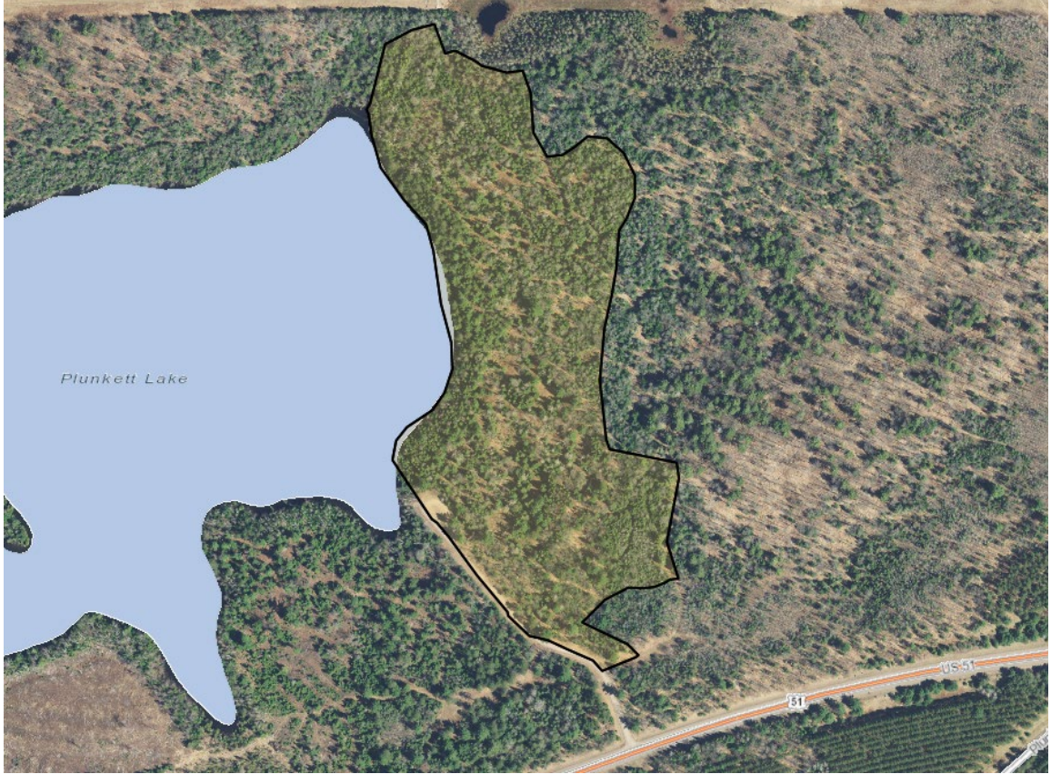
Figure 3. Leaf off aerial imagery of sale area post-harvest.