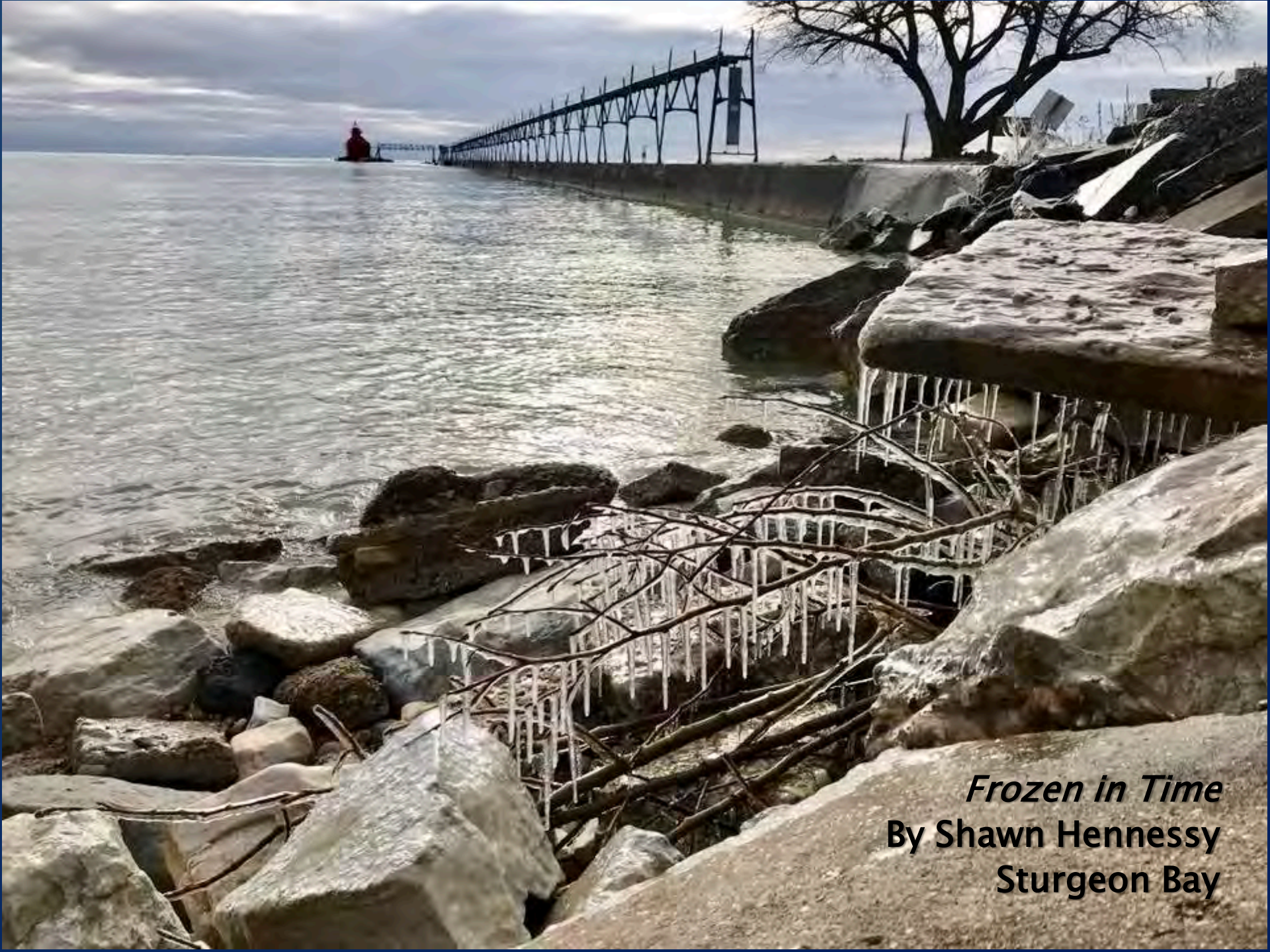
Frozen in Time Sturgeon Bay