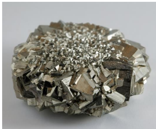
Arsenic-rich minerals, such as arsenic-rich pyrite (pictured), are natural sources of arsenic in groundwater in Wisconsin.

Data from Jan. 2022 – June 2023 for new well and pump work showed that of the 9,936 arsenic samples taken, 636 or 6.4% were over the enforcement standard (ES) of 10 ppb. The maximum level recorded was 907 ppb. About 39% or 3,814 samples were over the Preventive Action Limit (PAL) of 1 ppb.