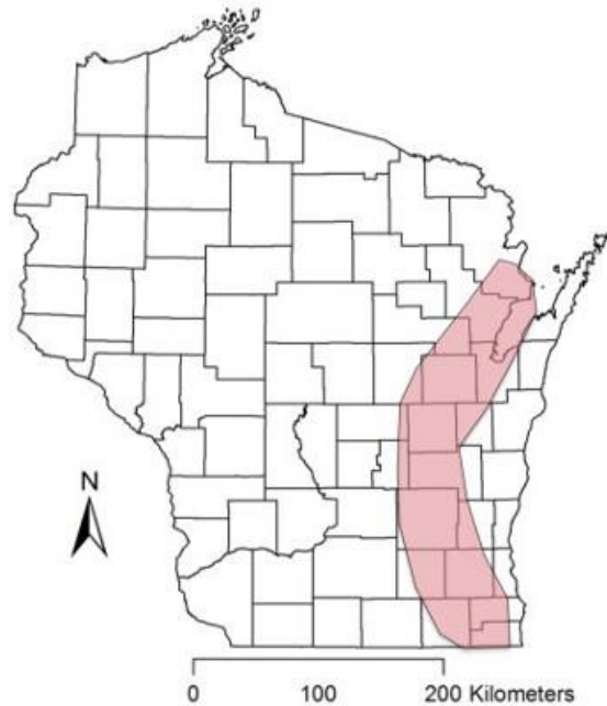
Area of Wisconsin where most of the wells that exceed the drinking water MCL for radium are located. This band coincides with where the Cambrian-Ordovician sandstone aquifer intersects the Maquoketa shale. Figure: Luczaj and Masarik, 2015.

In eastern Wisconsin , wells that draw water from the Cambrian-Ordovician deep sandstone aquifer, where it underlies the Maquoketa shale geologic formation, often have levels of radium above the public drinking water maximum contaminant level (MCL). This band of high radium activity stretches from Brown County in the north to Racine County in the south and primarily affects public wells, as high radium levels are present in groundwater drawn from deep bedrock aquifers and drilling wells deep enough to reach these deep aquifers is usually prohibitively expensive for homeowners using private water supply wells. High radium levels in the Cambrian-Ordovician deep sandstone aquifer is due to the fact that the solubility of radium is related to the solubility of sulfate minerals, and sulfate minerals in this part of the aquifer are more soluble than those to the west, where the sandstone aquifer is not "confined" beneath the Maquoketa shale formation.