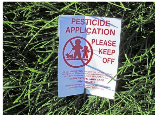
Pesticide application sign.

Pesticides are a broad class of substances designed to kill, repel or otherwise disrupt living things that are considered pests. They include insecticides, herbicides, fungicides and anti-microbials, among other types of biocides. Normal field applications, spills, misuse or improper storage and disposal can all lead to pesticide contamination in groundwater. As pesticides breakdown in soil and groundwater or are absorbed and metabolized by the target pest, some are converted into related compounds called metabolites, which may also be harmful to the pest or other living things.