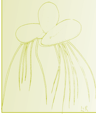
U. of Florida, Center for Aquatic Plants (Gainesville)